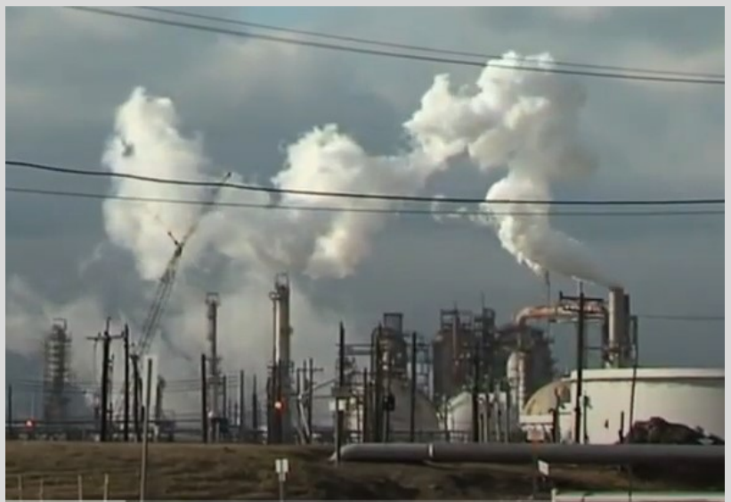
An air polluting facility outside of Port Arthur, Texas

Port Arthur, TX, exemplifies what it means to be a “fenceline community” or “sacrifice zone” where the population lives adjacent to hazardous petrochemical and other air polluting facilities. These communities tend to be disproportionately Black, Latino, or impoverished and face elevated rates of respiratory disease, cancer, reproductive disorders, birth defects, learning disabilities, psychiatric disorders, eye problems, nosebleeds, nausea, and early death. Elevated rates of